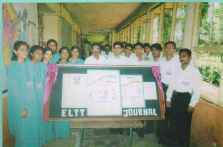
Publication of ELT. Journal 2007-2008