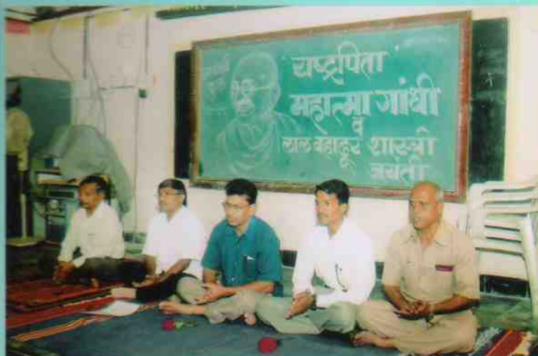
The Staff Involved in the prayer Raghupati Raghav Raja Ram, on the occasion of mahatma Gandhi Jayanti