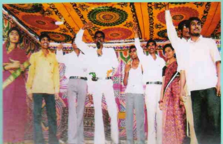
Trainee Teachers Presenting a paly during Internship Prosramme at Shankarao Desai HighSchool.