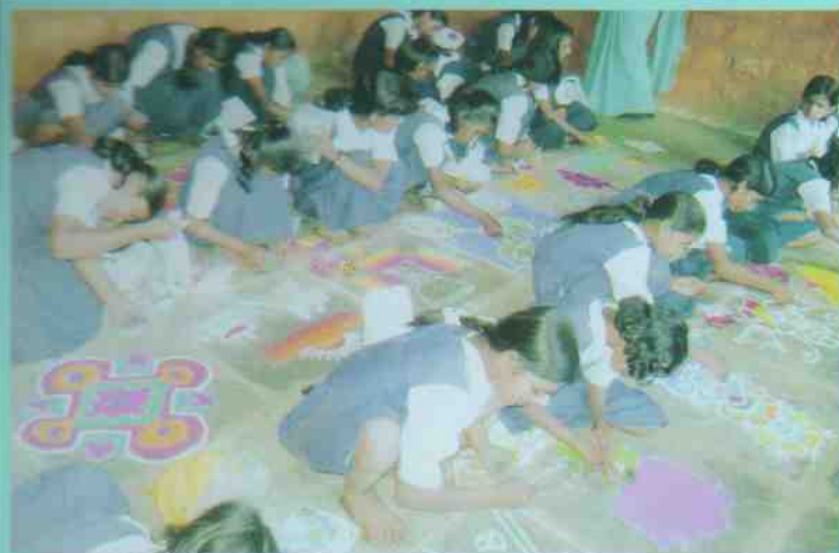
Students drawing the "Ranjoli"