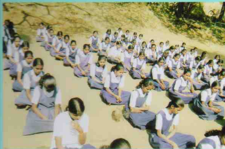
Morning Assembly at S.D. High School Mahsave Tal. Bhudargad, Dist. Kolhapur.