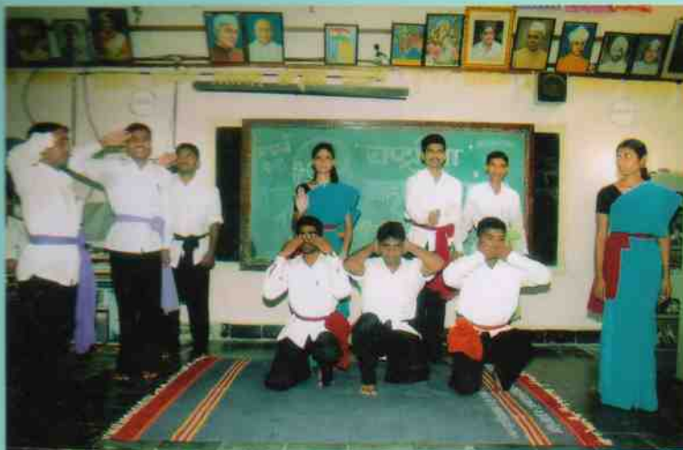
A Play on M.K. Gandhis three monekeys on the eve of Gandhi jayanti 2 October 2007