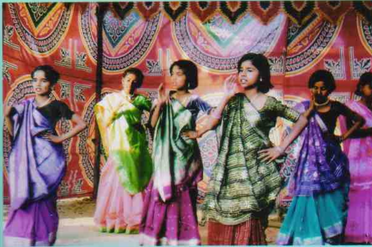
School Children Presenting a group dance - A cultural Programme during Internship 2008