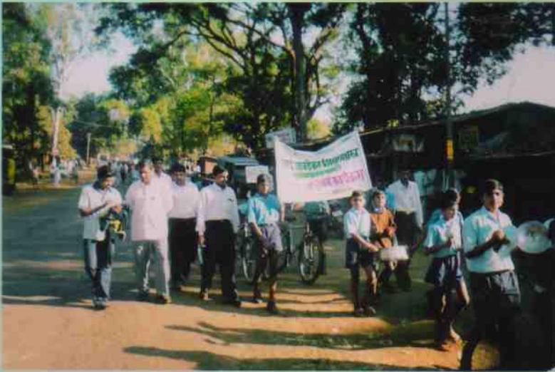
A Rally on gramswachhata Abhayan and Aurogya Sapthaha, during Internship Programme 2006