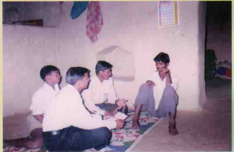
Student teachers guiding a Young boy to Rejoin the school