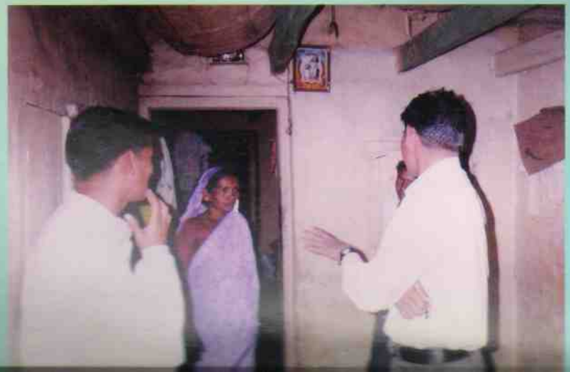
Student teachers guiding & Counselling a Village mother to avoid drop out