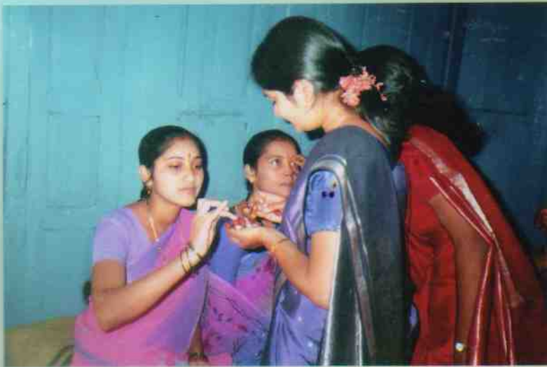
Village women receiving Haldikumkum on the eve of maker sankranti 14 Jan. 2006