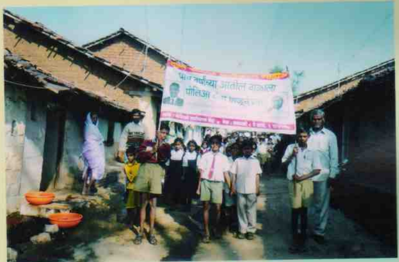
A Rally on Puls Polio Mohim 2006