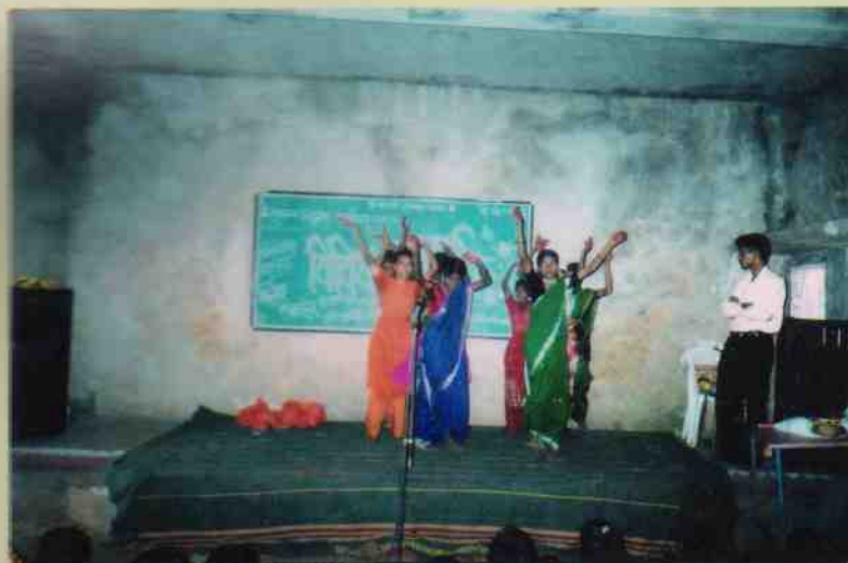
Vividgundarshan programme at Kadgaon High School Kadgaon 2005 - 2006