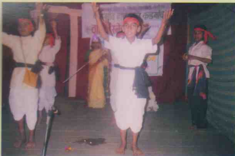
School students Presenting folk dance during Internship 2006