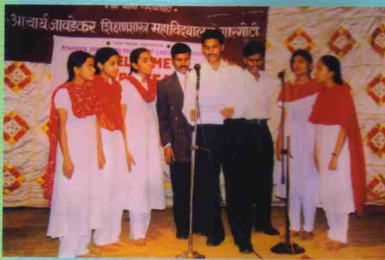
Cultural Programme 2004-2005