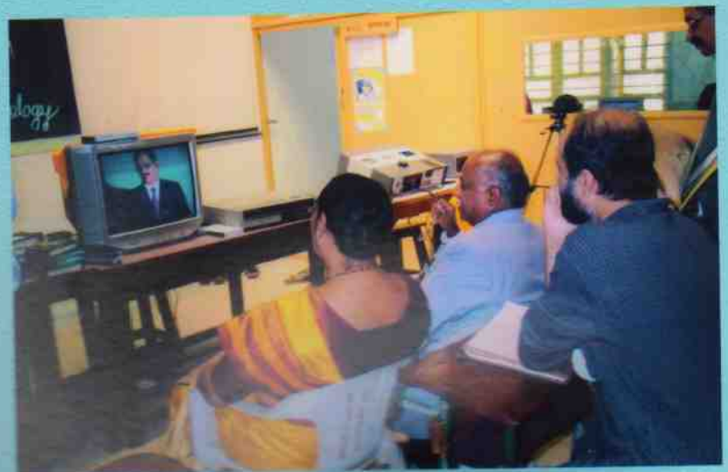
Visit to E. T. Lab