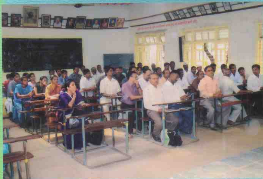
Interactions with the Alumni