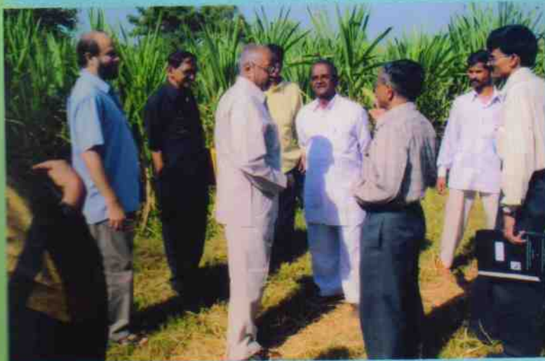
Visit to Agriculture Unit