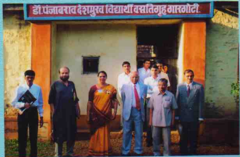
Visit to Boys Hostel