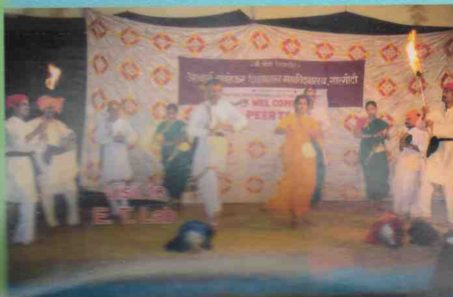
Folk dance Prog. 2004 - 2005