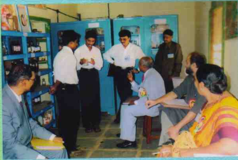
Visit to Science Lab