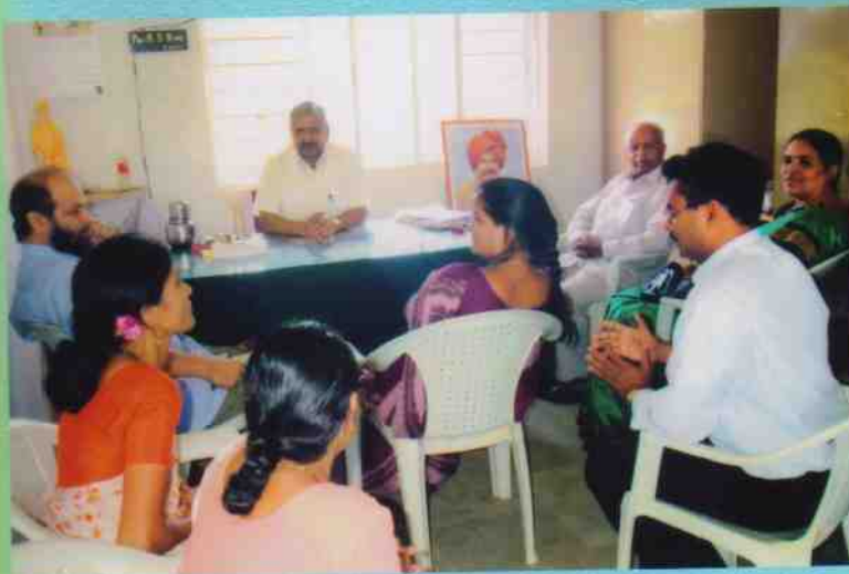
Interactions with practice Teaching Heads