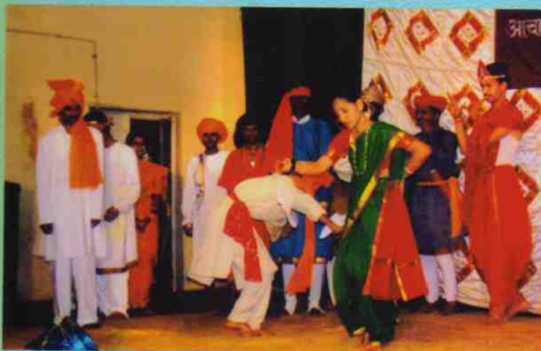
Cultural Programme 2004-2005