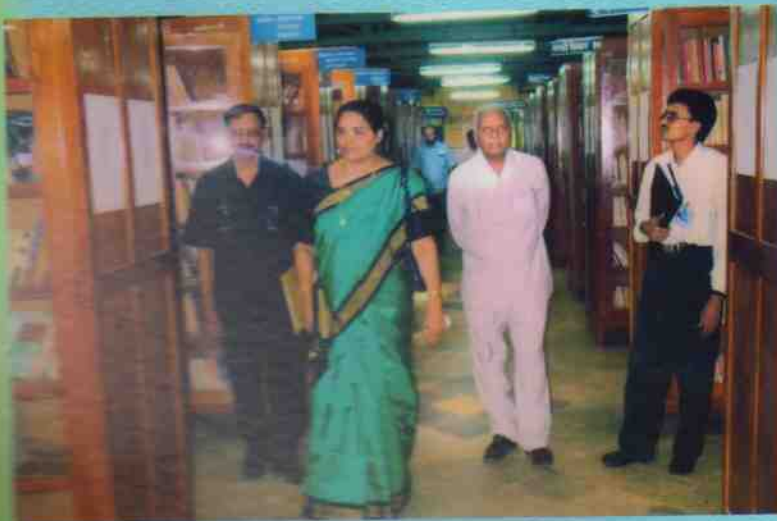
Visit to Central Library