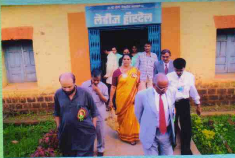
Visit to Ladies Hostel